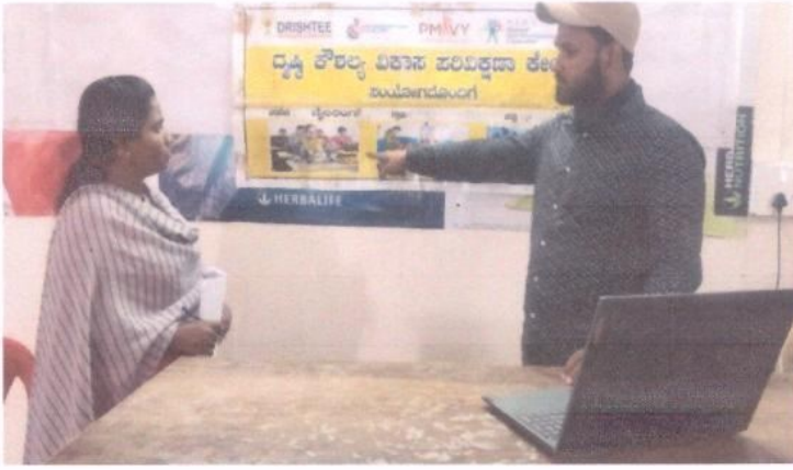
Skill Development for youths