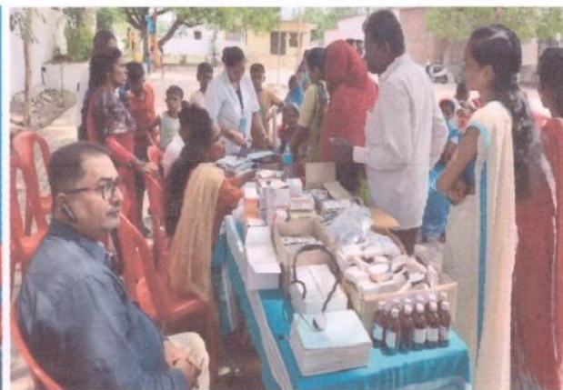
Free Health Checkup Camp