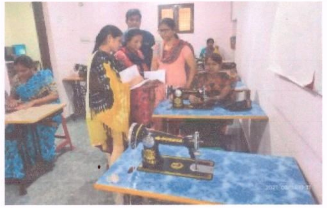
Tailoring training centre